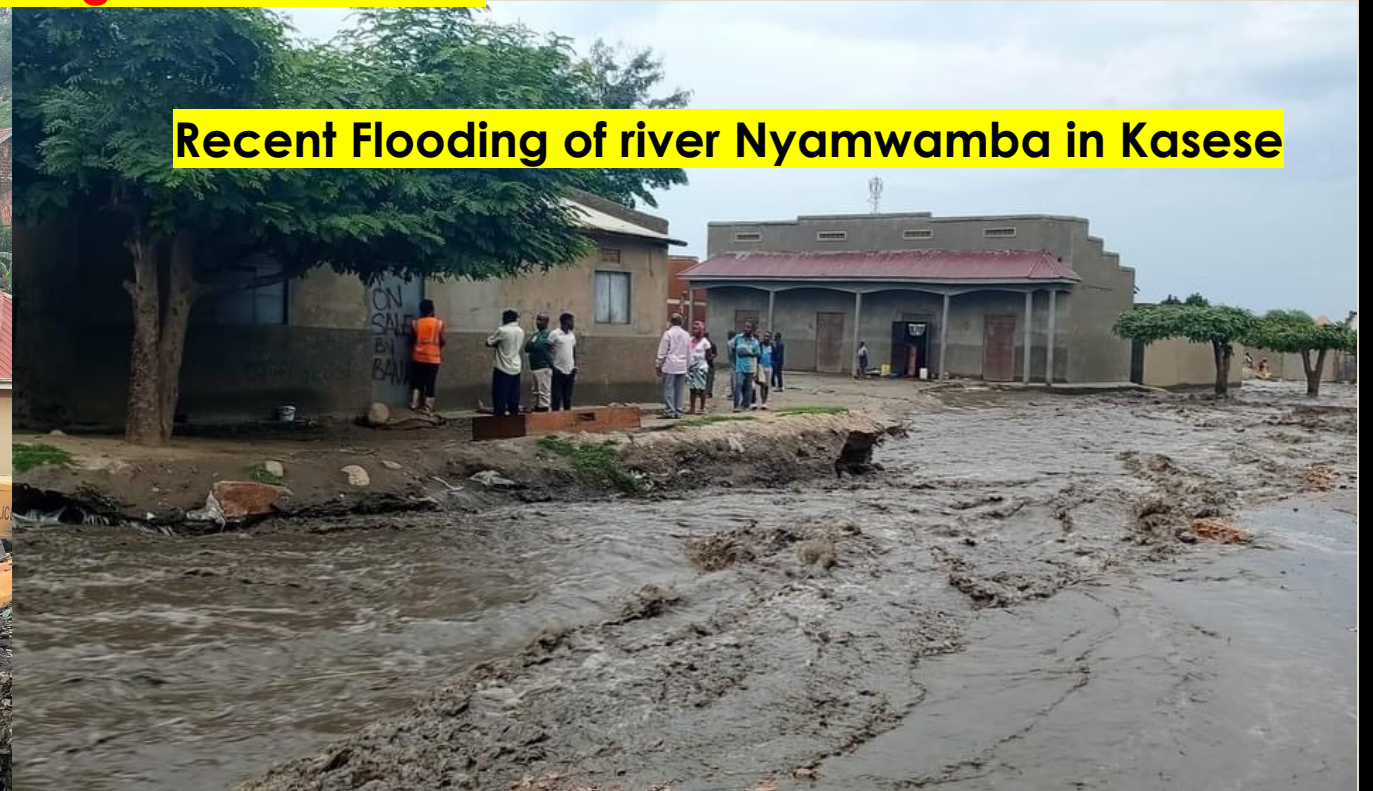
Recent Flooding of river Nyamwamba in Kasese